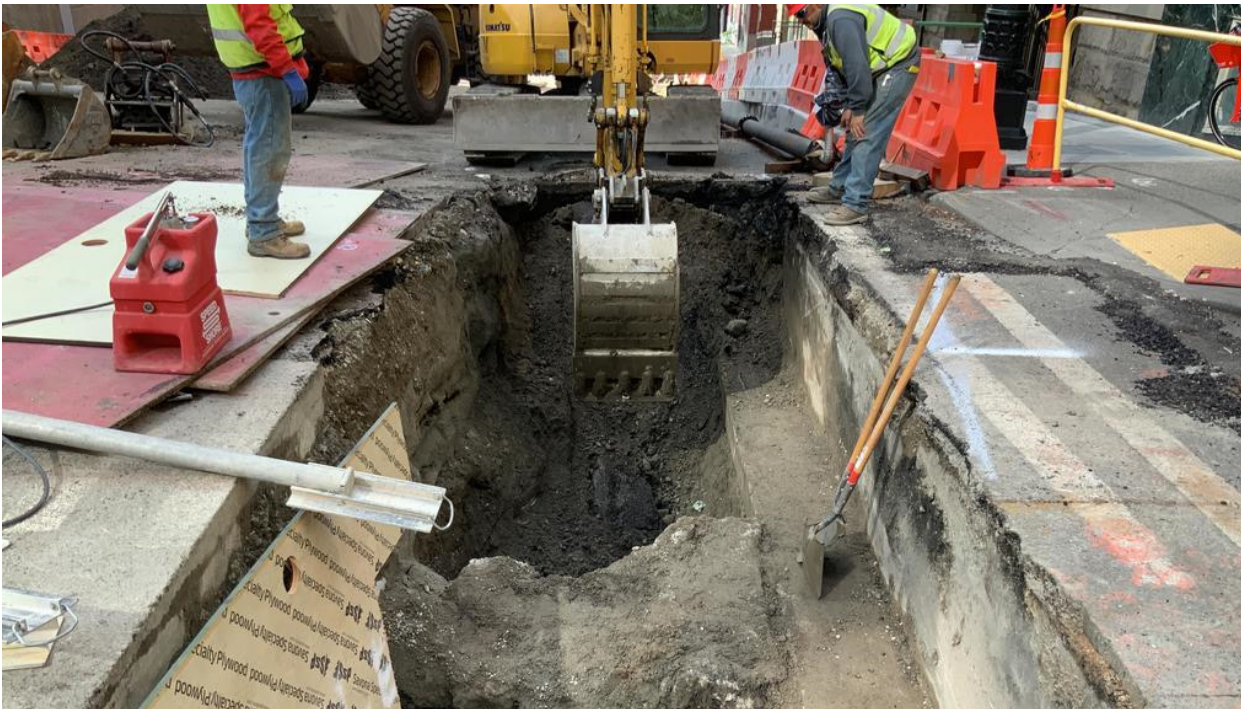
Example of excavation for utility work