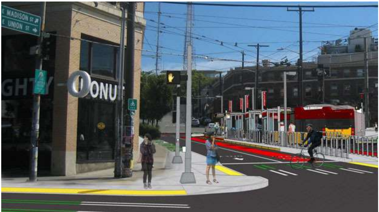
A rendering of the future center-running bus station at Madison St and 12th Ave