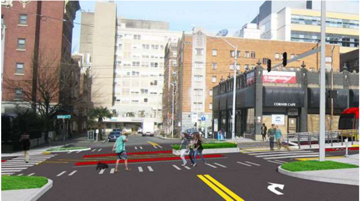
A rendering of the future center-running bus station at Madison St and Terry Ave